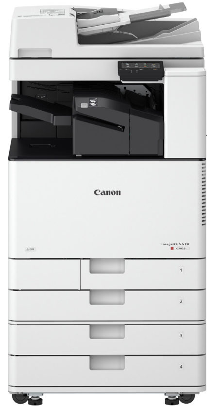
*Shown with optional accessories

A color A3 multifunctional that's easy to use and designed to help limit the administrative costs related to printing – a complete end-to-end document workflow solution for any office.